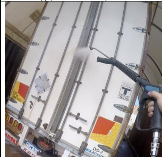
Rinse with Rinse Lance