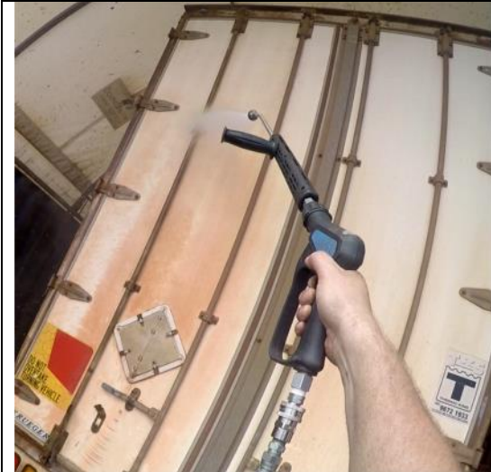
Apply Part A with Soap Lance